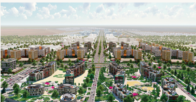
MIXED-USE Urban Master Plan