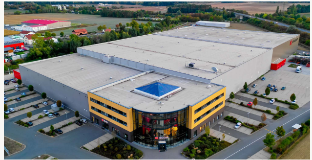
INDUSTRIAL Kramp Strullendorf