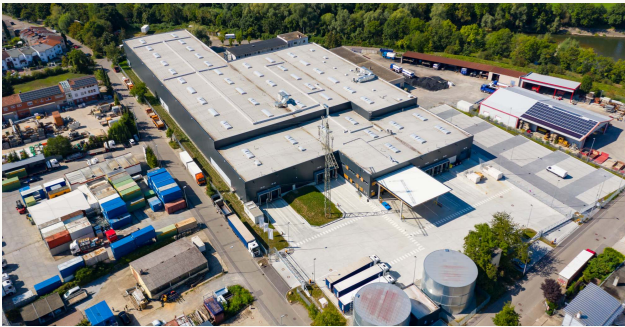
AUTOMOTIVE Porsche GSE Freiberg