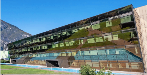
INDUSTRIAL / FLAGSHIP Stella Industrial Complex