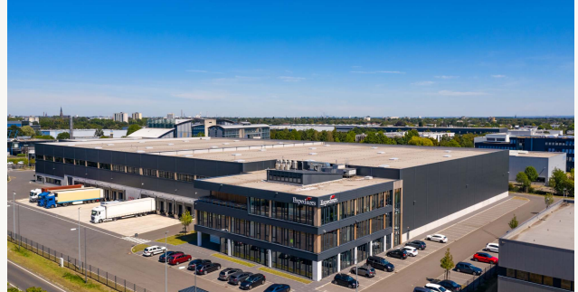
LOGISTICS SEGRO Expeditors Krefeld