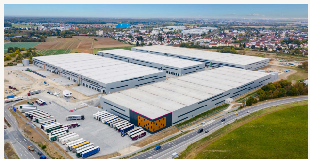
DEVELOPMENT Infrastructure Development

243+ PROJECTS · 12 COUNTRIES · SINCE 1965